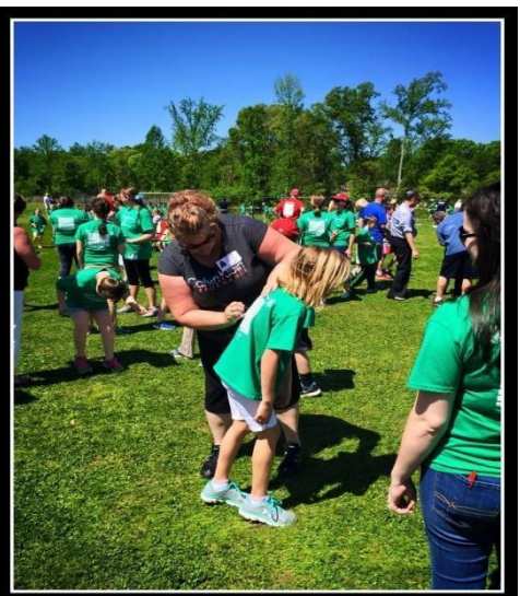
Teachers, Staff, Parents & Volunteers checking off laps ran